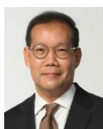
Nadhavathna Krishnamra Thailand

Director-General of the Department of International Organizations Ministry of Foreign Affairs