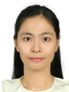
Theint Theint Thu Myanmar

Secretary The Standing Committee on Political Development, Mass Communications and Public Participation of the House of Representatives