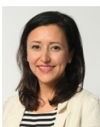
Katherine Amatavivadhana Thailand

Director-General of the Department of International Organizations Ministry of Foreign Affairs