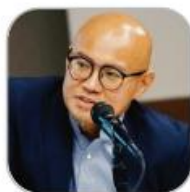
El Cid Butuyan United Nations